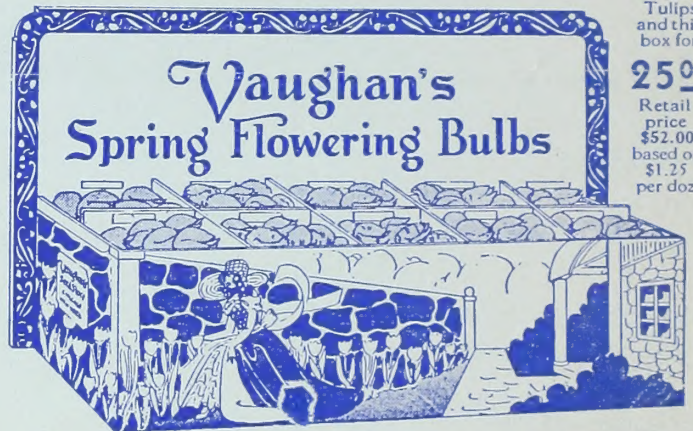
Tulip Display Box Holding 500 Bulbs, 50 each of 10 Named Varieties

We use TOP SIZE BULBS, the size which sells best over the counter. The 10 named varieties (50 each) of good named varieties. The price to you is $25.00 for the box and 500 bulbs of 10 named varieties. You retail them for $1.25 a dozen, or more, because the selection is worth more, doubling your money. Each variety is packed 50 in a bag labeled with its name. You empty one bag into a compartment, and refill in the same manner when it is empty. This prevents mixtures and loss of bulbs. After the display box and first collection have been bought, refill orders will be accepted for $24.00 for 500 bulbs, 50 each of 10 varieties, in bags of 50; or $46.00 for 1,000 bulbs, 100 each of ten varieties. Colored pictures are provided to paste on the compartments. This box keeps the bulbs in the open air, thus preventing bacterial rot which comes when they are sealed in cartons. The named varieties are kept apart without mixing, which adds greatly to their value.